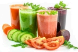
FOOD & DRINKS