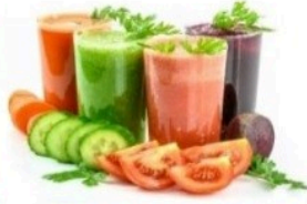
FOOD & DRINKS