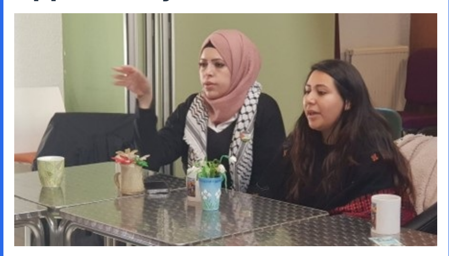
Mon, 24 Jul 2023 18:30, at Union Chapel, Compton Terrace, London

Organised in collaboration with CADFA (Camden Abu Dis Friendship Association).