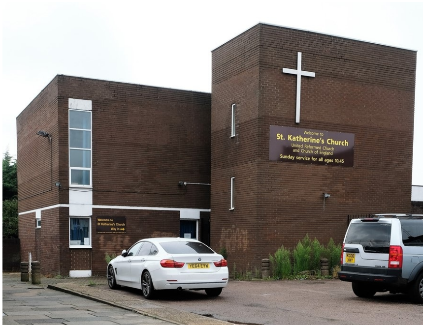
Below: St Katherine of Genoa Church

The five United Reformed Churches – Bury Park URC, Edward Street URC, St Katherine of Genoa URC, St Ninians URC and Wigmore Church (URC and Methodist) – will amalgamate into one church. This new church will be based in the former Wigmore Church building on Crawley Green Road in Luton, and the former St Katherine of Genoa URC Building on Katherine Drive in Dunstable.