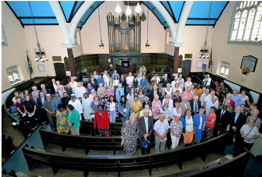
Above: Building Closing Service at Bury Park URC

Please note that last week's news incorrectly stated that Bury Park URC had closed. This is not entirely correct as it is merely the building that has closed - the congregation is amalgamating with the four other Luton and Dunstable churches to form Newland Church. Newland Church will have two sites, one in Luton and one in Dunstable, serving two communities through one structure.