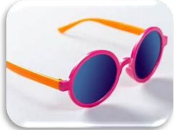
Illustration by lambsongs.co.nz via freebibleimages.com