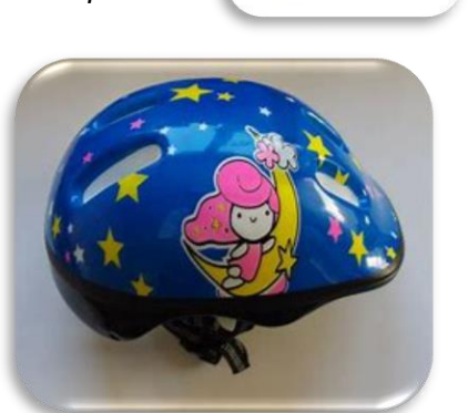
Hat or helmet