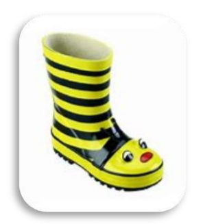
Shoes, boots or slippers