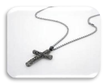
Cross or a children's Bible